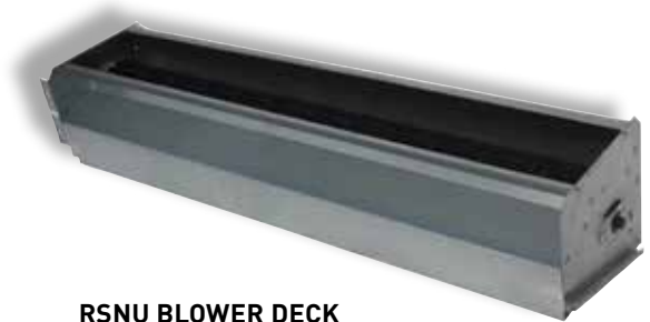
RSNU BLOWER DECK