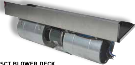
RSCT BLOWER DECK

If there is evidence of dirt or dust build-up in the evaporator motor or blowers, they should be cleaned either by vacuum cleaning (if working in an apartment) or by removing the unit to a workshop location and cleaning with compressed air.