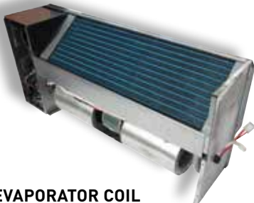
RSCT EVAPORATOR COIL

Check the coil for cleanliness and uniformity of fins. If the coil is dirty, vacuum clean with a soft brush attachment. This is the only form of cleaning that should be carried out within an apartment. If the coil requires additional cleaning, the unit must be removed from the wall sleeve and cleaned using compressed air and/or washed. These operations MUST be carried out in a facility properly equipped to handle this type of work in a safe and professional manner.