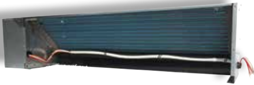
RSNU EVAPORATOR COIL

To access the components within the roomside section of the unit, disconnect the power cord and then remove the unit chassis front cover by unscrewing the hex head retaining screws that hold the front cover in place (use a ¼" hex head driver). You will then have access to the following components: