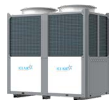
ccHPWH550 550-MBH capacity

80 Hartford Avenue, Mount Vernon, NY 10553 Tel: 877-ICE-AIR-1 (877-423-2471) Fax: 914-668-5643 email: sales@ice-air.com