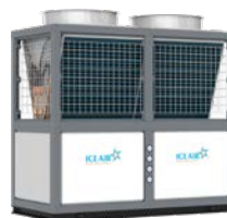
ccHPWH275 275-MBH capacity