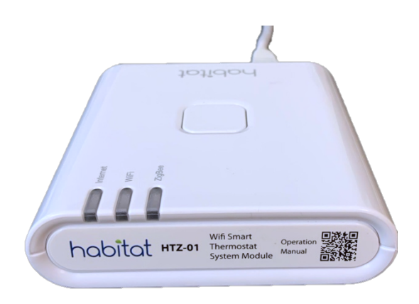
WIFI Thermostat System Module