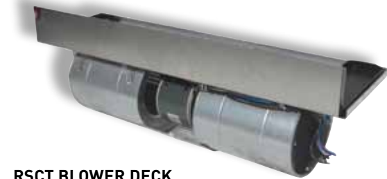
RSCT BLOWER DECK

If there is evidence of dirt or dust build-up in the evaporator motor or blowers, they should be cleaned either by vacuum cleaning (if working in an apartment) or by removing the unit to a workshop location and cleaning with compressed air.