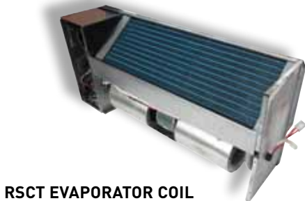
RSCT EVAPORATOR COIL

Check the coil for cleanliness and uniformity of fins. If the coil is dirty, vacuum clean with a soft brush attachment. This is the only form of cleaning that should be carried out within an apartment. If the coil requires additional cleaning, the unit must be removed from the wall sleeve and cleaned using compressed air and/or washed. These operations MUST be carried out in a facility properly equipped to handle this type of work in a safe and professional manner.